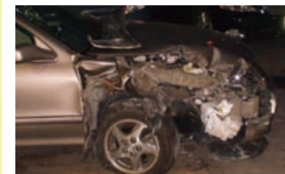
The damaged car

I woke up after a while. My car was badly damaged. The windshield, the engine and the wheels were all severely broken and the hood fell off the car. The police and ambulance had already arrived there. The injured were being taken to the hospital, but my mother and I felt completely well even after the accident.