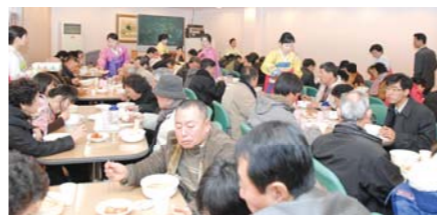
New comers are being served noodles for lunch at the New Comers’ Welcoming Room after Sunday Morning Service.

Through this education program, new-comers are learning the basics of God’s word, gaining useful church information, and they adjust to their new life in the church. In addition, because they need to receive the Holy Spirit to become children of God, they attend the prayer meeting and receive the Holy Spirit.