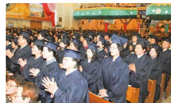
The Completion Ceremony of Manmin Bible Academy was held during Sunday Evening Service on December 13, 2009.

The education consists of two semesters; in spring and in autumn of every year. The students attend the class once a week from 8 PM to 10 PM and there are the basic, intermediate and upper level classes. Each class is a 10-week-long program. The student studies the ‘The New and Old Testaments’ and ‘The Message of the Cross’ during the basic level class, currently held in the third sanctuary; ‘The Measure of Faith’ and ‘Man of Spirit’ are