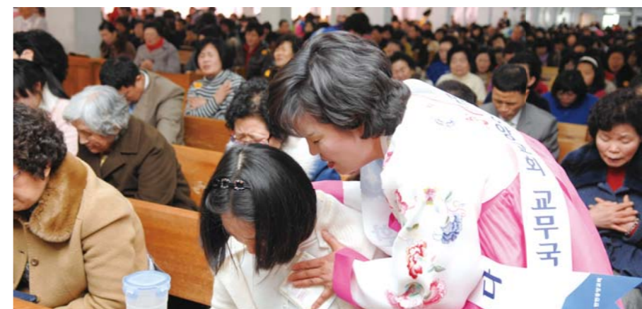
District leaders are helping with attendees’ prayers at the Holy Spirit Prayer Meeting for New Comers.