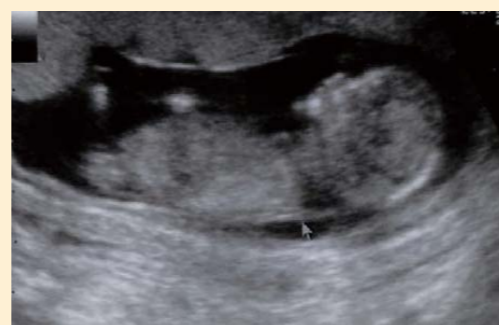
A sonogram of a normal pregnant woman (six months pregnant)

◆ The dark part covering the fetus is amniotic fluid.