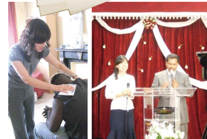
Visited a brother who was healed of drug addiction and administered handkerchief prayer