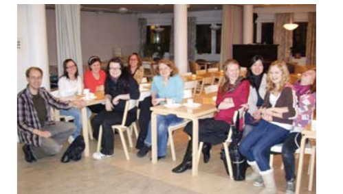
Having a fellowship with those are preparing praise service at ‘Freedom Church’ of Finland

earnestly and looked thirsty in spirit. It seemed that she wanted to meet the Lord but couldn’t find the way.