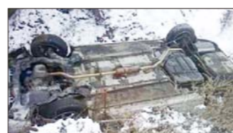
The overturned car after the accident

Previously, I enjoyed watching entertainment TV programs in Sunday evening after coming home from church, but I stopped watching them after listening to the sermons about keeping the Sabbath holy. I listened to hymn songs instead of worldly music. I realized that God was pleased with my deeds and protected us from a huge accident.