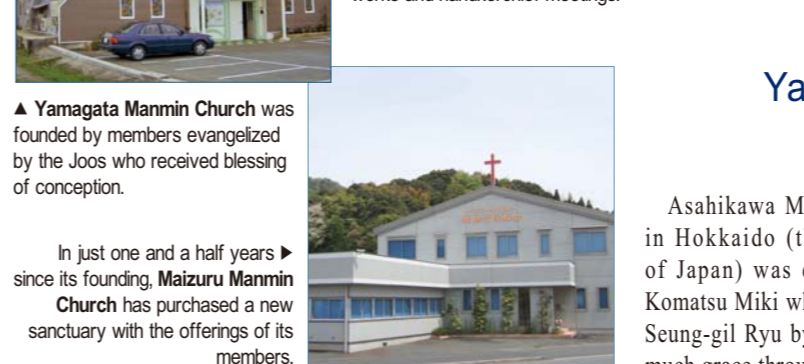
▲ Yamagata Manmin Church was founded by members evangelized by the Joos who received blessing of conception.