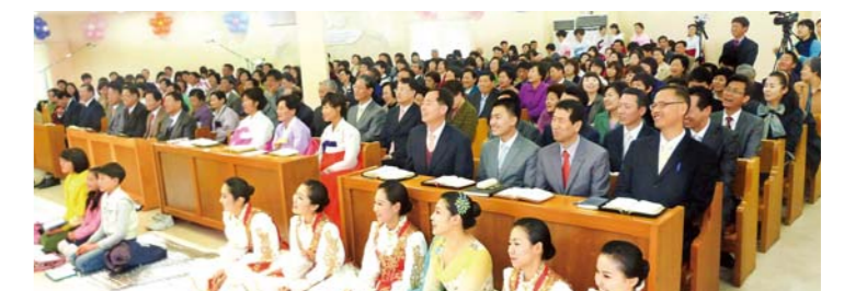
13 th Anniversary Service at Gumi Manmin Church's new sanctuary

from promotion at work to financial blessings.