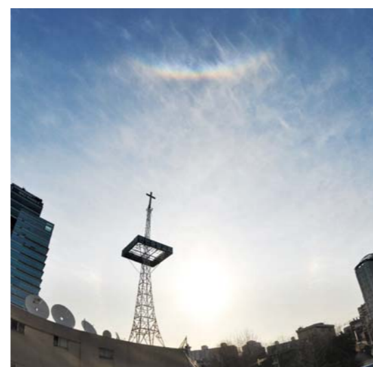
A clear rainbow appeared in the sky above Manmin Central Church for about half an hour, beginning at 8:45 a.m., on Monday, March 8, 2010

Furnishings used for services, such as crosses, curtains, sitting cushions, as well as Bibles; handkerchiefs that have been prayed on; published works and photographs of the Senior Pastor; weekly bulletins; church calendars; and banners must be brought to locations designated by the Church and incinerated, sold, buried, or otherwise discarded. When the owner of the handkerchief of God's power passes away, the handkerchief may be buried along with the believer.