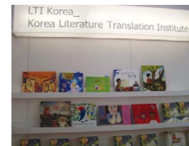
A Spring of Wisdom, the Comic Version, Volumes I and II displayed at Bologna Children's Book Fair