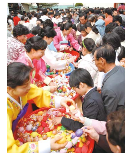
Manmin members celebrating the Resurrection of Our Lord as they distribute eggs in the office for the Women's Mission

As Manmin Central Church celebrated the Passion Week and Easter, the Church as one was reminded of the love of Our Lord and spent the week in reverence.