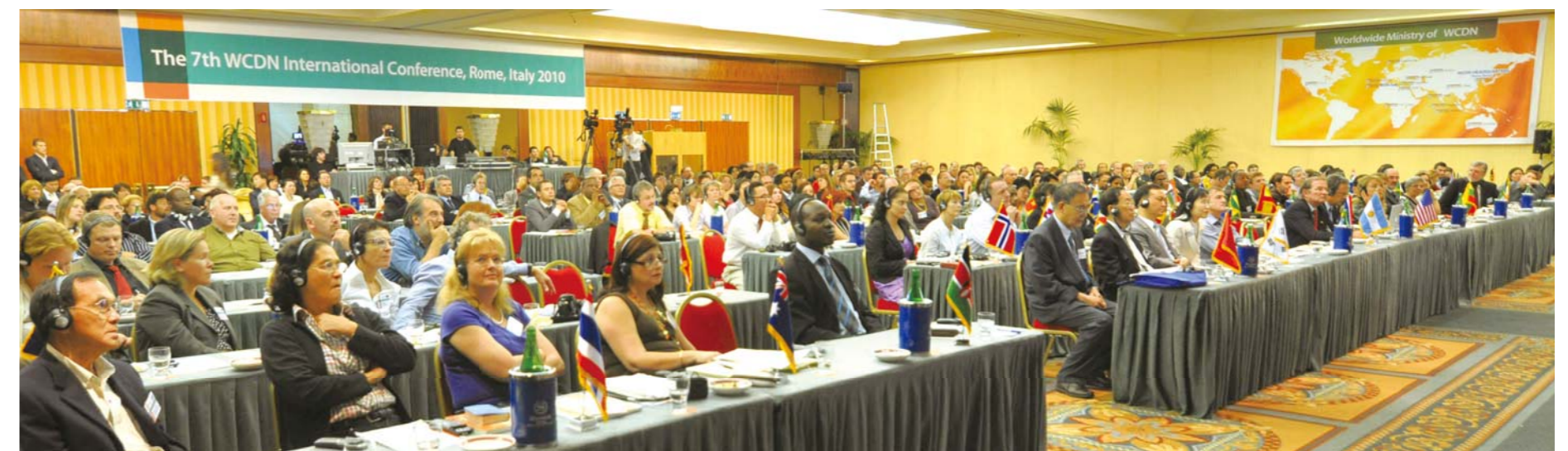
On May 21 and 22, the 7 th International Christian Medical Conference took place at the Conference Hall of Hotel Sheraton in Rome of Italy with the theme "Spirituality and Medicine"

The 7 th International Christian Medical Conference Held in Rome Brought 270 Doctors from 40 Nations