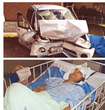
She miraculously survived in an accident in which her car collided with another vehicle that crossed the center line, but the aftereffects tormented her for a long time.