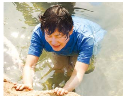
She prays with her heart's desire dipping herself into Muan Sweet Water.

during the Dawn Prayer Meeting on June 1, the paralysis around my forehead was gone. The next day, I met the Senior Pastor whom I had been looking forward to seeing, and I was overwhelmed with indescribable feelings.