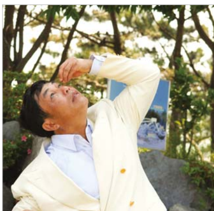
He was healed of astigmatism of his left eye by putting Muan Sweet Water into his eyes.

Nowadays, they are leading a happy Christian life receiving material blessings and good health. Experiencing these works of God, I am working for the Lord with joy and thanksgiving.