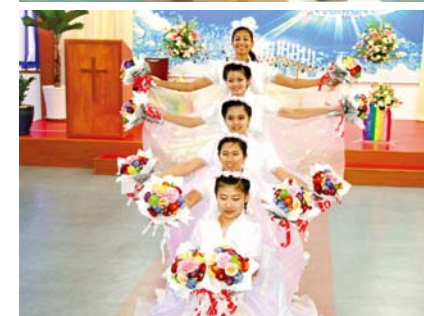
Members of Penang Deaf-mute Manmin Church glorified God with special performances