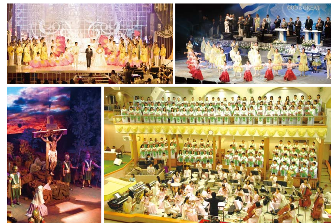
Members of the Performing Arts Committee glorify God at many Christian events and crusades

As Isaiah 43:21 says, "The people whom I formed for Myself will declare My praise," God takes delight in the praises we offer to Him. As recorded in this Scripture, since its founding, Manmin Central Church has placed great emphasis on cultivating as many praise and dance teams of the Performing Arts Committee as possible, and many teams have been invited to many Korea's Christian events and crusades,