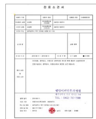
After the prayer: Healed of tinnitus and recovery of hearing