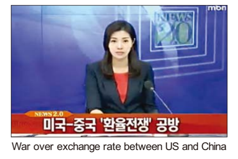
War over exchange rate between US and China