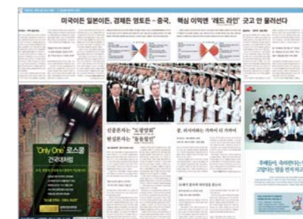
The Joong-Ang Daily, M-BN (Maeil Business Network), The Yonhap News, SBS (Seoul Broadcasting System)