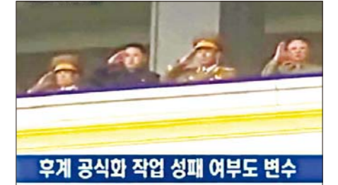
North Korean leader's son rises as likely successor