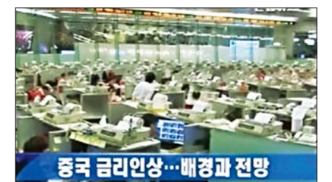
What does China's interest-rate rise mean?