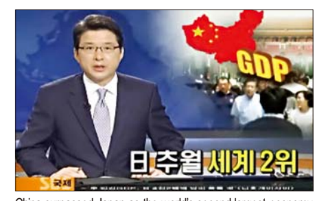
China surpassed Japan as the world's second largest economy