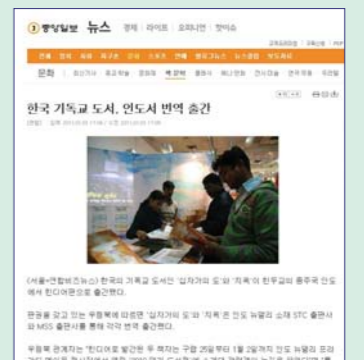
The publication of the Hindi edition of The Message of the Cross appeared at the website of The JoongAng Ilbo