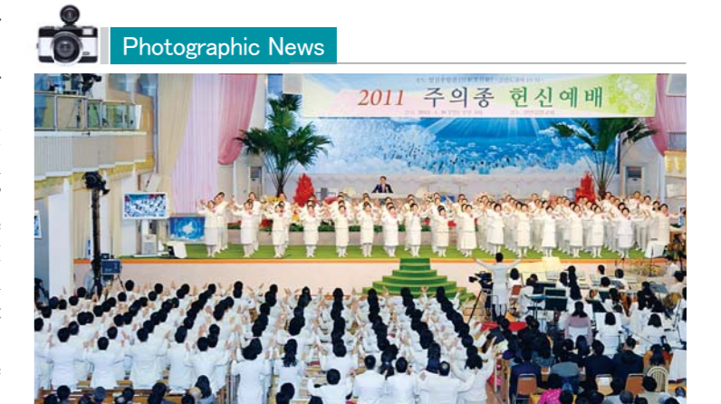
The pastors were singing special songs to God at the Pastors' Devotional Service they offered on January 9, 2011.

This message series, 'Keys to Studying Well' that began on January 9th, is expected to gather many more testimonies as the series is preached.