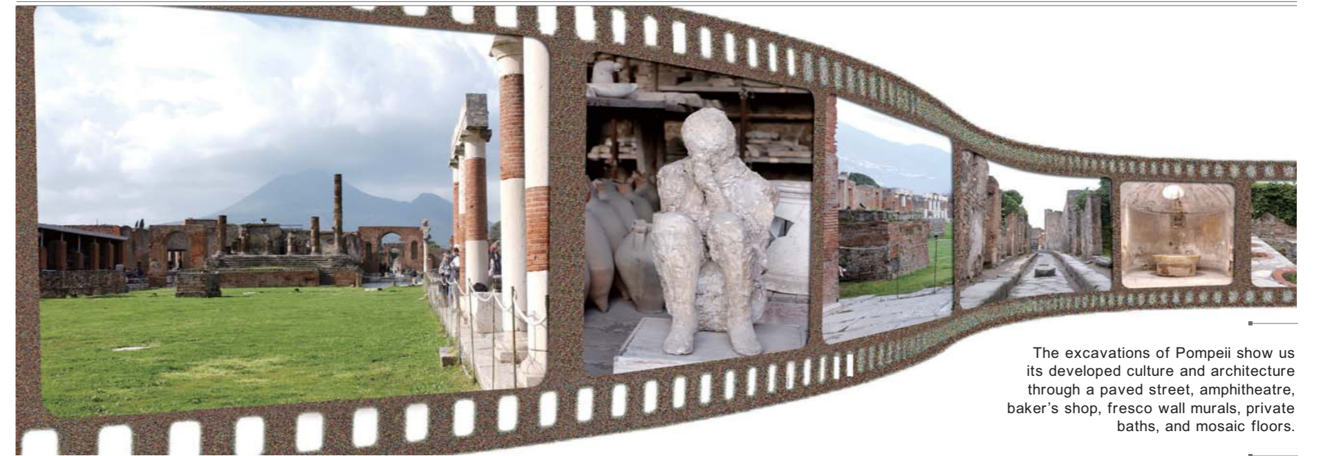
The excavations of Pompeii show us its developed culture and architecture through a paved street, amphitheatre, baker's shop, fresco wall murals, private baths, and mosaic floors.

Christ, His Second Advent, the Millennium, and the eternal heaven. 5. Members of Manmin Central Church confess their faith through “The Apostles' Creed” each time they come together and believe in its content verbatim. “[God] Himself gives to all people life and breath and all things.” (Acts 17:25) “And there is salvation in no one else; for there is no other name under heaven that has been given among men by which we must be saved.” (Acts 4:12)