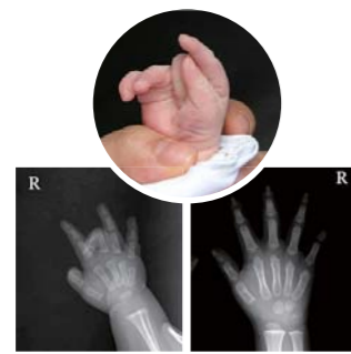
Before prayer (5 months old, July 30 th , 2008) After prayer (37 months old, March 15 th , 2011)