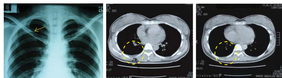
Her Broken Rib