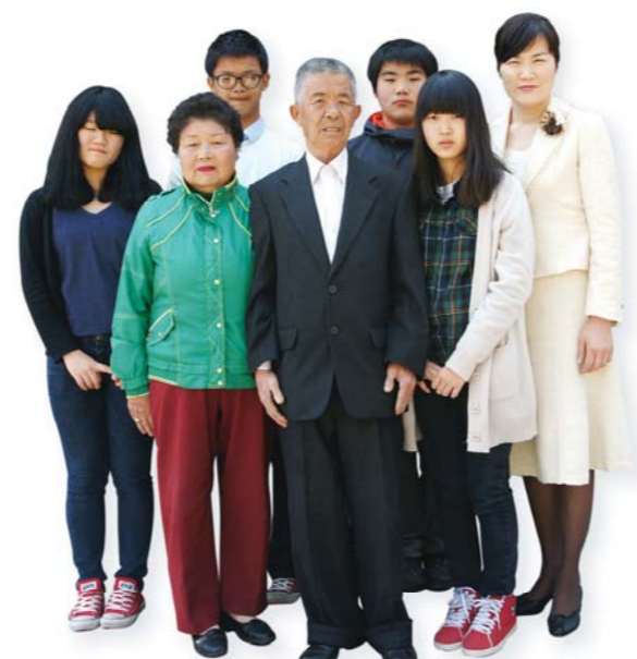
Together with her parents-in-law and 4 other people she evangelized