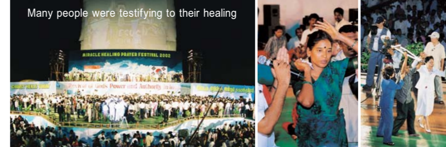
Many people were testifying to their healing