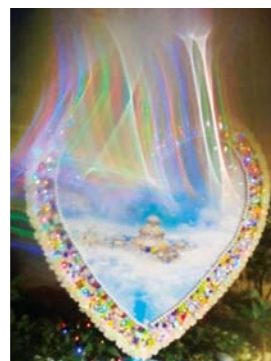
"I saw five-colored lights."