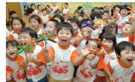
"We made dragonflies."