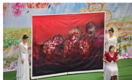
"I am so scared of Hell."