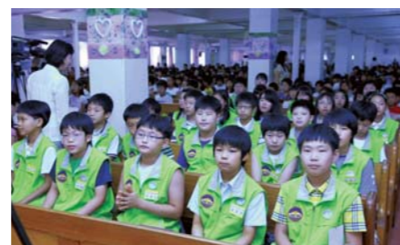
"We are serving with love and humility."