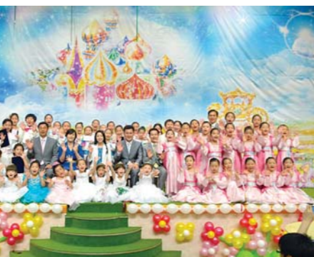
"We all took part in the Performing Arts Festival. Hallelujah!"