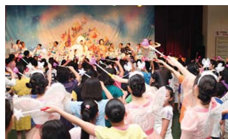
"I became filled with the Holy Spirit."

Also, I was moved by many of my friends who felt happy during the Summer Bible School. I was determined to become a man of goodness like the Lord so that I can become a spiritual warrior who delivers the love of the Lord to countless souls."