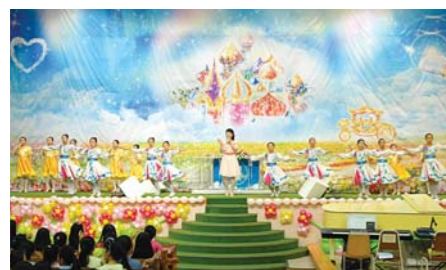
"We are members of the praise team, worship team, and dance team of Children Sunday School."