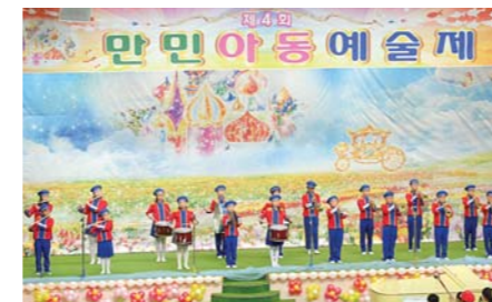
"We are the drum and fife band of Children Sunday School."

I also took part in it and won the Serem prize. Even though I was able to receive the grand prize, I was happy because I could feel God accepted my performance with joy. I am already looking forward to the Performing Arts Festival next year."