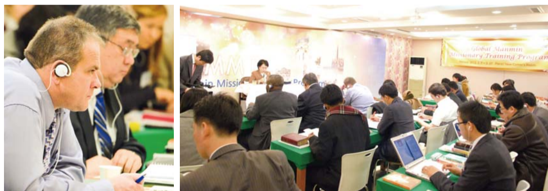
MMTC's Global Missionary Training Program is being held in Newcomer's Reception Room and all lectures are translated into English and Chinese.