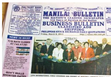
The Business Section on page 1 in Manila Bulletin which is major daily newspaper in the Philippines.