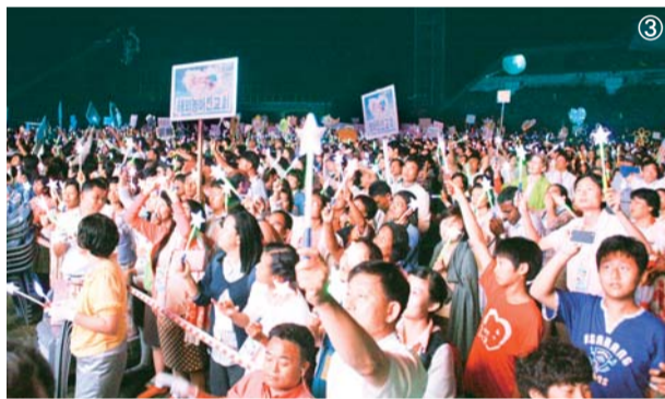
The hearing-impaired believers experienced the love and power of God on their visit to Manmin and came to have greater spiritual faith and bigger hope for Heaven. ■ Photo 1: Arrival at Incheon International Airport on August 3, 2012 ■ Photo 2: During the service interpreted into Korean, Malaysian, and Thai sign languages ■ Photo 3: At the Camp Fire Worship & Praise of 2012 Manmin Men's and Women's Missions' Summer Retreat