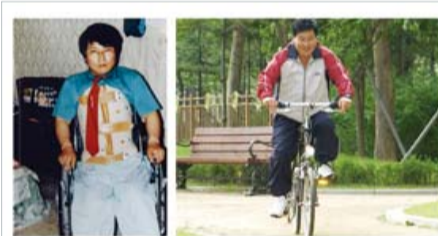
He once had to wear a brace for his backbone and sleep upright in a sitting position, but now he came to ride a bike.

the time, my symptom of right-sided hemiplegia got better and not long after I came to walk without the cane. Additionally, I came to have better eyesight so I came to see things without eye glasses. Hallelujah!