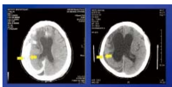
Before prayer, subarachnoid hemorrhage is seen. After prayer, it has been gone.

The case is of a 49-year-old male. He injured his head after he fell on an icy road on December 13 th , 2012. He was brought into the ER.