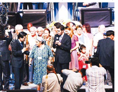
Dr. Jaerock Lee's Israel United Crusade 2009 (September 6 to 7 in 2009)