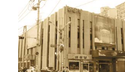
Third Sanctuary (March 1987-February 1991)