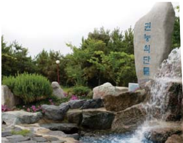
Muan Sweet Water Site (Haeje-myoun, Muan-gun, Jeonnam Province)