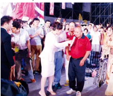
Those who were testifying to their healing in Manmin Summer Retreat (August 5, 2013)