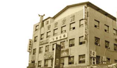
Second Sanctuary (December 1984-March 1987)