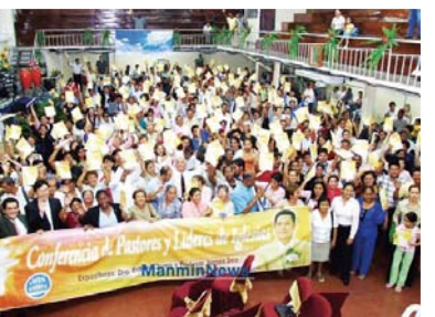
Manmin International Seminary's lecturing tour in the nine Latin countries (November, 2007)