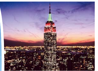
GCN TV's transmitter in New York Empire State Building