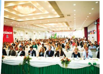
WCDN's 10 th International Medical Conference in Mexico (June, 2013)