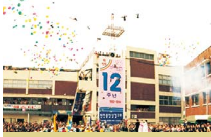
Fourth Sanctuary (February 1991-June 1996)