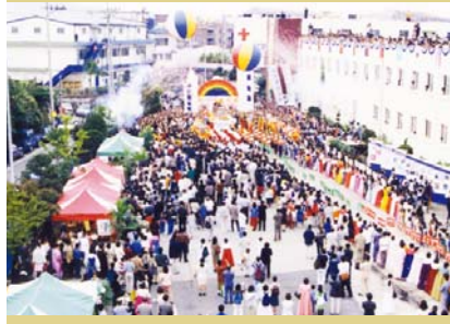
Fifth Sanctuary (Since June 1996)