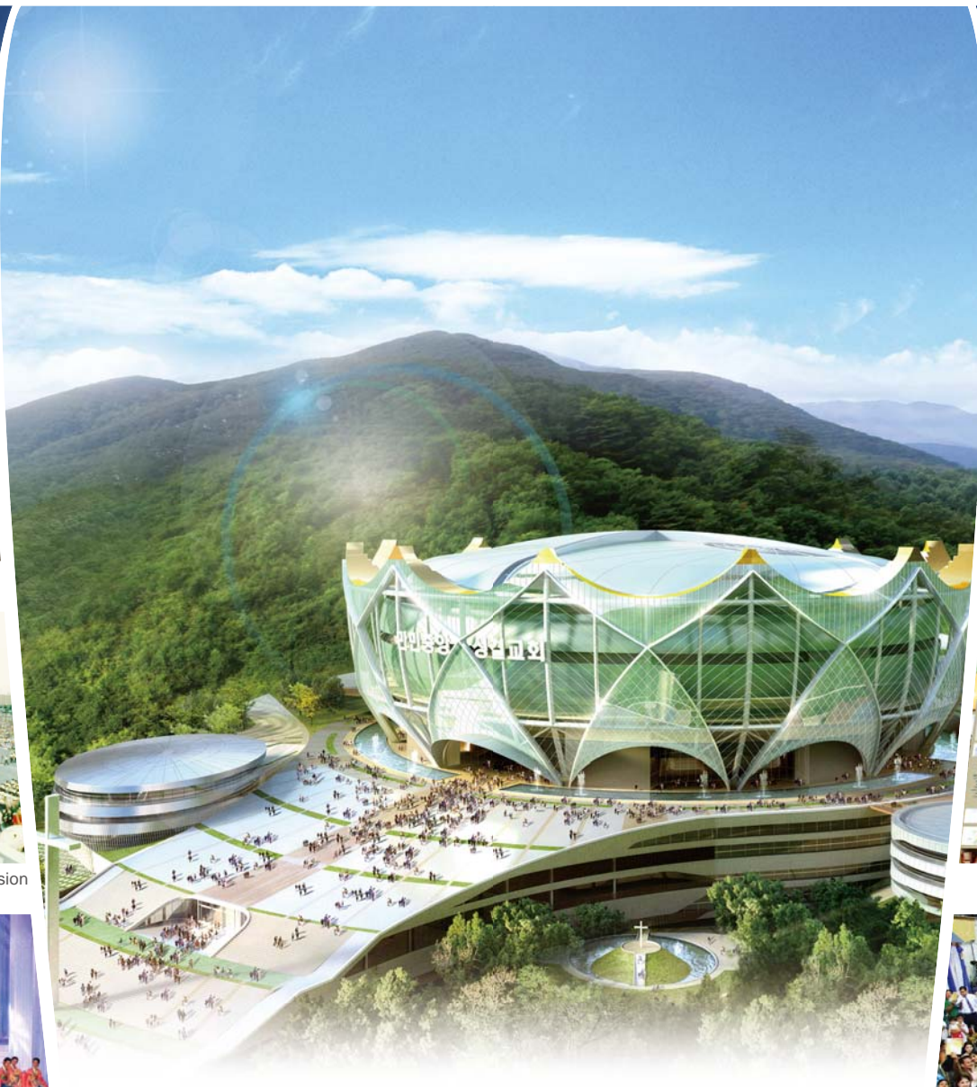
The bird's-eye view of Canaan Sanctuary that reveals God's glory and shines the light