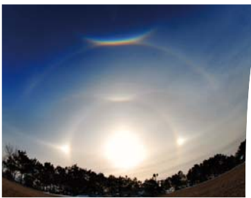
Extraordinary rainbow (Muan Manmin Church, January 27, 2011)