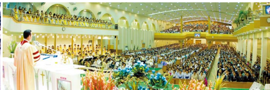
Manmin's worship service is broadcast via GCN TV and the Internet and attended by people in around 170 countries