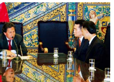
Meeting with the Peruvian President Alejandro Toledo in Presidential Palace (November 30, 2004)