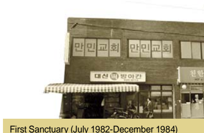
First Sanctuary (July 1982-December 1984)

From July 1998, the church underwent three trials in which the members became more devoted to prayer and overcame them with goodness and faith. The following great and amazing works of God, the church's overseas crusades, and the rapid spiritual flow proved that the trials had been all those of blessings.