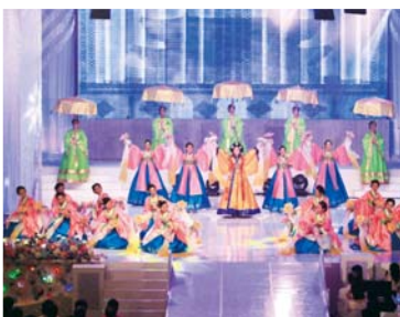
The 30 th Church Anniversary Celebration Performance (October 7, 2012)