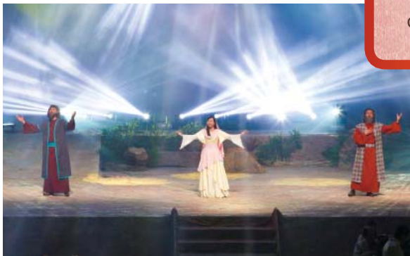
Peter, Mary Magdalene, and Paul praised the true love of the Lord who gave up everything to save us.