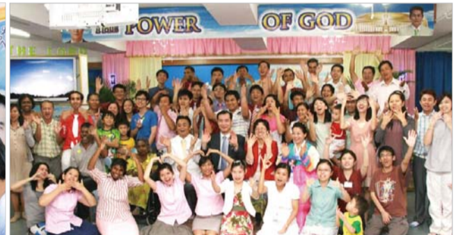
He prayed for a member in Thailand with the handkerchief (Acts 19:11-12). He rejoiced during Penang Manmin Deaf Church's anniversary celebration in Malaysia.