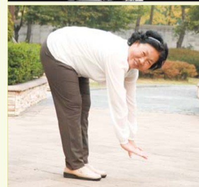
After the prayer, she was healed of L4 and L5 herniated disc pressing her nerves.