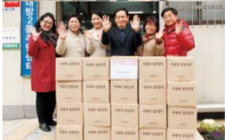
Through the efforts of the Women's Mission, kimchi was made with love and shared with about 1,300 households near the church that are in need through several organizations.

On November 18th and 19th in 2015, the church had its '18th Love Sharing Event' with Kimchi. The members of Women's Mission gathered in the backyard of the church.