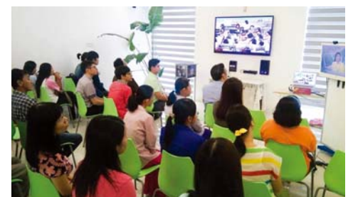
They are offering up Manmin's worship service on GCN