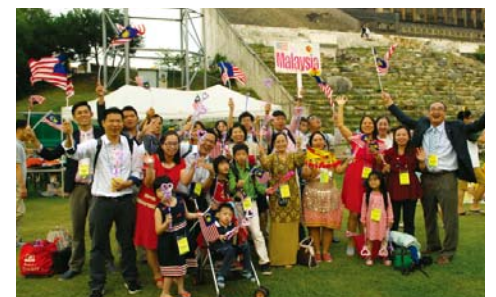
With people who came to Manmin Summer Retreat 2016

thanks and glory to God who made us happy.