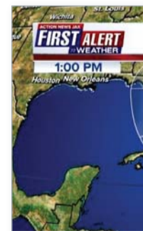
▲ Hurricane Irma changed its course.

Because there are many major cities on the east of the US mainland, evacuations of 20 million residents in the state of Florida were ordered and there were mandatory evacuations for a third of them which accounts for more than 6.5 million people.