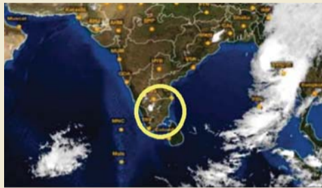
Photo 2. The rain cloud formed after the prayer.