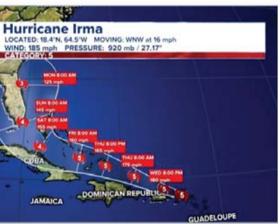
...changed its course unlike the forecast (left) and weakened and turned into a tropical storm.

U.S. After Dr. Lee's prayer, unlike the forecast saying that it would make landfall in Florida as a category 4 and move northward following the east coast of the US, Hurricane Irma continued westerly and then changed its course to move inland and parallel the west coast. It also weakened to category 3, 2, and 1, and at 9 P.M. on September 11, it dissipated to a tropical storm. Moreover, it changed its course to the western areas that have the national parks and wet lands with low populations, not the cities with high populations in the east. Thus, there was no great damage.