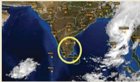
Photo 1. Before the prayer, the satellite imagery showed no rain cloud.

In September 2009, when Dr. Lee conducted the Israel United Crusade, Israel had been suffering from severe drought. However,