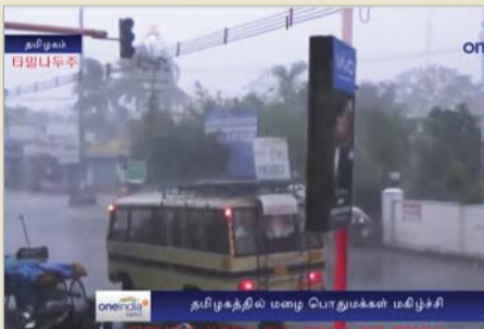
▲ One India Tamil News TV reported about the rain.