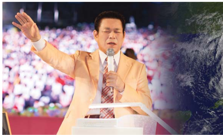
Hurricane Irma changed its course.

In the Bible, there were several records of wonders. When God spoke to Isaiah (Isaiah 38:12-18). When Isaiah cried to God, He brought the shadow of the sun and the moon. When he cried to God, it didn't rain for three and a half years, and when he cried to God, God has manifested wonders through a pastor who received the Holy Spirit. On the anniversary, let's look back upon wonders manifested through the Holy Spirit.