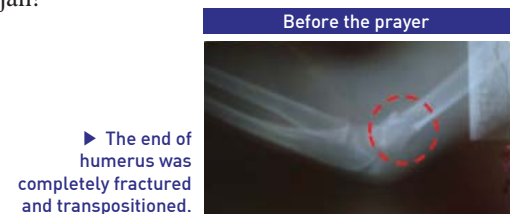
▶ The end of humerus was completely fractured and transpositioned.

arm bones were connected perfectly and properly. Hallelujah!