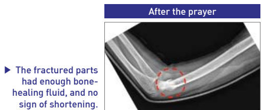
▶ The fractured parts had enough bone-healing fluid, and no sign of shortening.