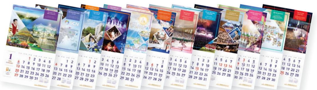
The church's Year 2019 Calendar

This dating system was devised in 525 by Dionysius Exiguus of Scythia Minor who prepared a table of the future dates of Easter. It gained popularity during the reign of Charlemagne in the 9th century and has been widely used still today.