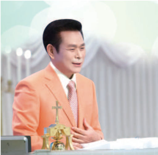
Senior Pastor Rev. Jaerock Lee