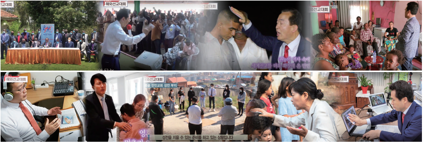
Manmin world mission is being actively carried out through missionaries who dedicate themselves to preaching the gospel of the Lord through the works of the power and the holiness gospel. (from the video “the 2021 Overseas Mission”).