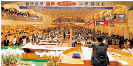
1992 Holy Spirit Explosion Crusade (Above) The Two Week Consecutive Special Revival Meeting (Below)

But our ways were not just easy. We also went through times of trials where we couldn't see any way out, and we sometimes had to pray in mourning and with hot tears. But the final outcomes were always blessing, and there was always the evidence of God being with us even while we were going through trials. Such evidence only kept on increasing.