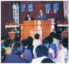
The establishment service of Manmin Central Church on Oct. 10, 1982.

Right from the opening, Manmin Central Church had such rapid church growth through signs and wonders. We have been accomplishing world evangelism greatly. Many members received answers and blessings and their faith has been growing.