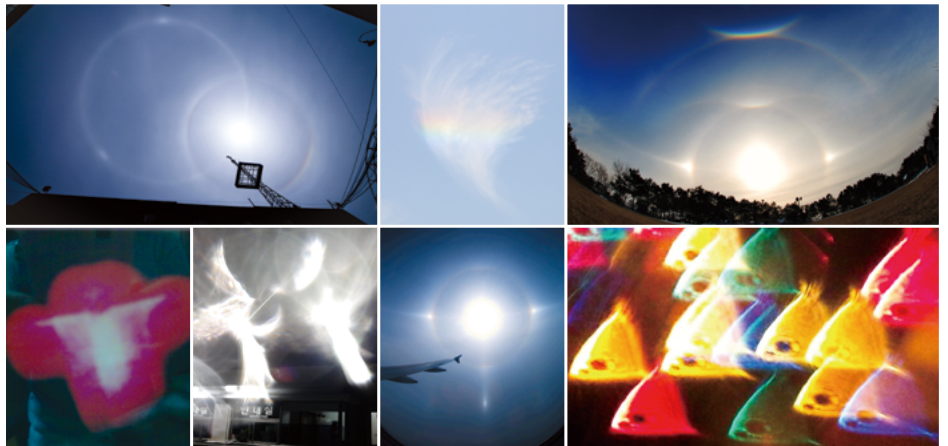
Various shapes of rainbows and various types of aurora-like lights that confirmed the God of love being with us and added hope and faith in heaven.

Our church had great trials and crises that seemed impossible to overcome. But God was always with us even during the trials. After such time passed, we could see why He allowed for us such time through the fruit of blessings. As explained, our Father God has guided us with so much endurance and love to establish this church and our denomination, to let us accomplish world evangelism, and to let the faith of church members grow up.