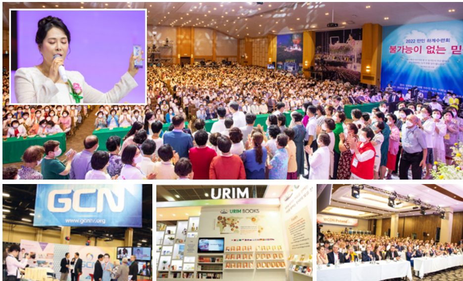
2022 Manmin Summer Retreat with the subject, "With Faith, Nothing Is Impossible" (Above) GCN, Urim Books, and WCDN delivering the gospel of holiness and the works of power (Below)

Many couples had a baby although they were infertile for several years or even decades; fetuses with Down's syndrome were born without it through prayers; so many fetuses' gender was changed through prayer. So many members were protected even in big traffic accidents where the vehicles had to be scrapped. Other than these, even if I mention only important works of God that happened until now, I won't be able to mention them all.